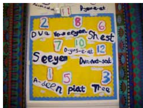
Displays around school celebrating the diversity of our School Community and the work of the School Council