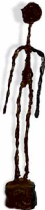
A sculpture created by Year One children based on the work of Alberto Giacometti

Teachers focus successfully on collaborative working, developing thinking, questioning and problem solving skills so that pupils quickly become independent and confident learners.