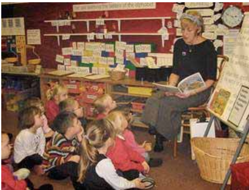
Sharing books together at home is invaluable for children's learning

If you are positive and enthusiastic, then your child is likely to feel the same way